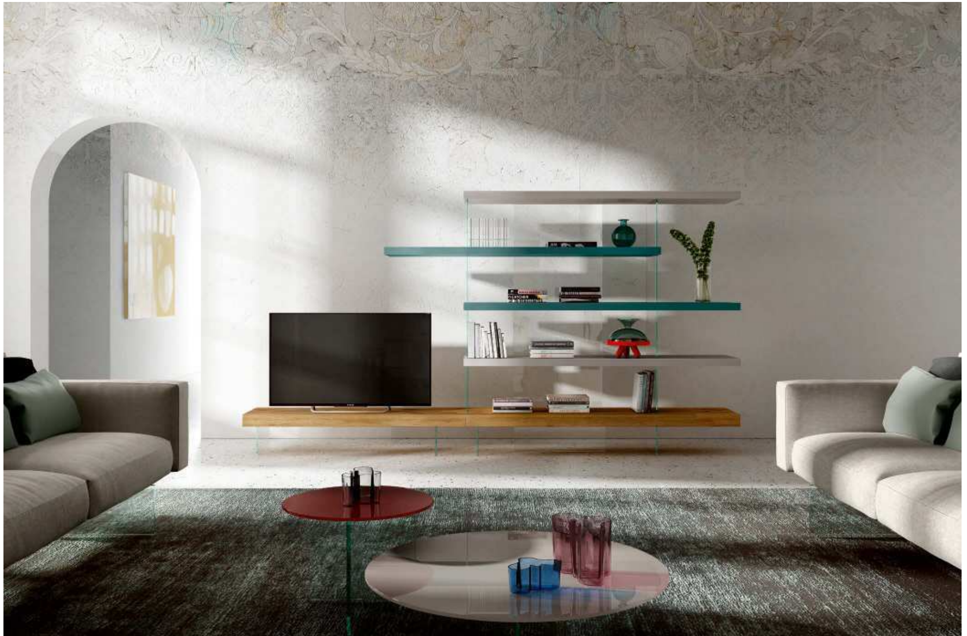
AIR SHELF - 0562 Wildwood naturale, lacquered mandorla and ottanio