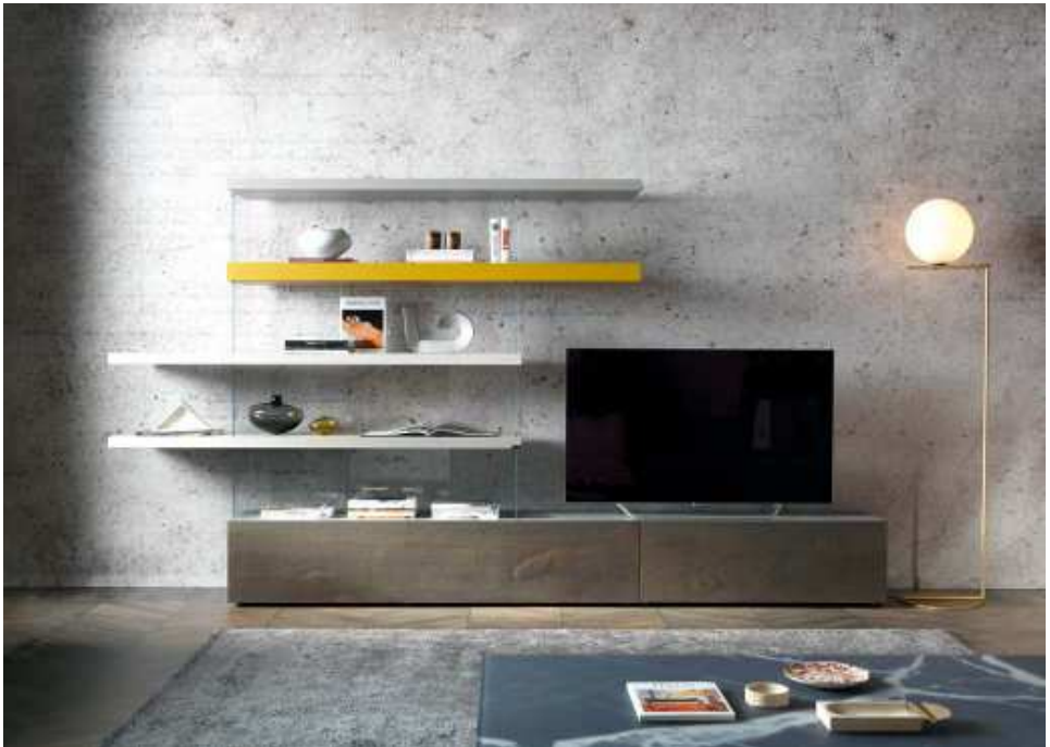
Wildwood grigio, lacquered tortora, ocra and iuta