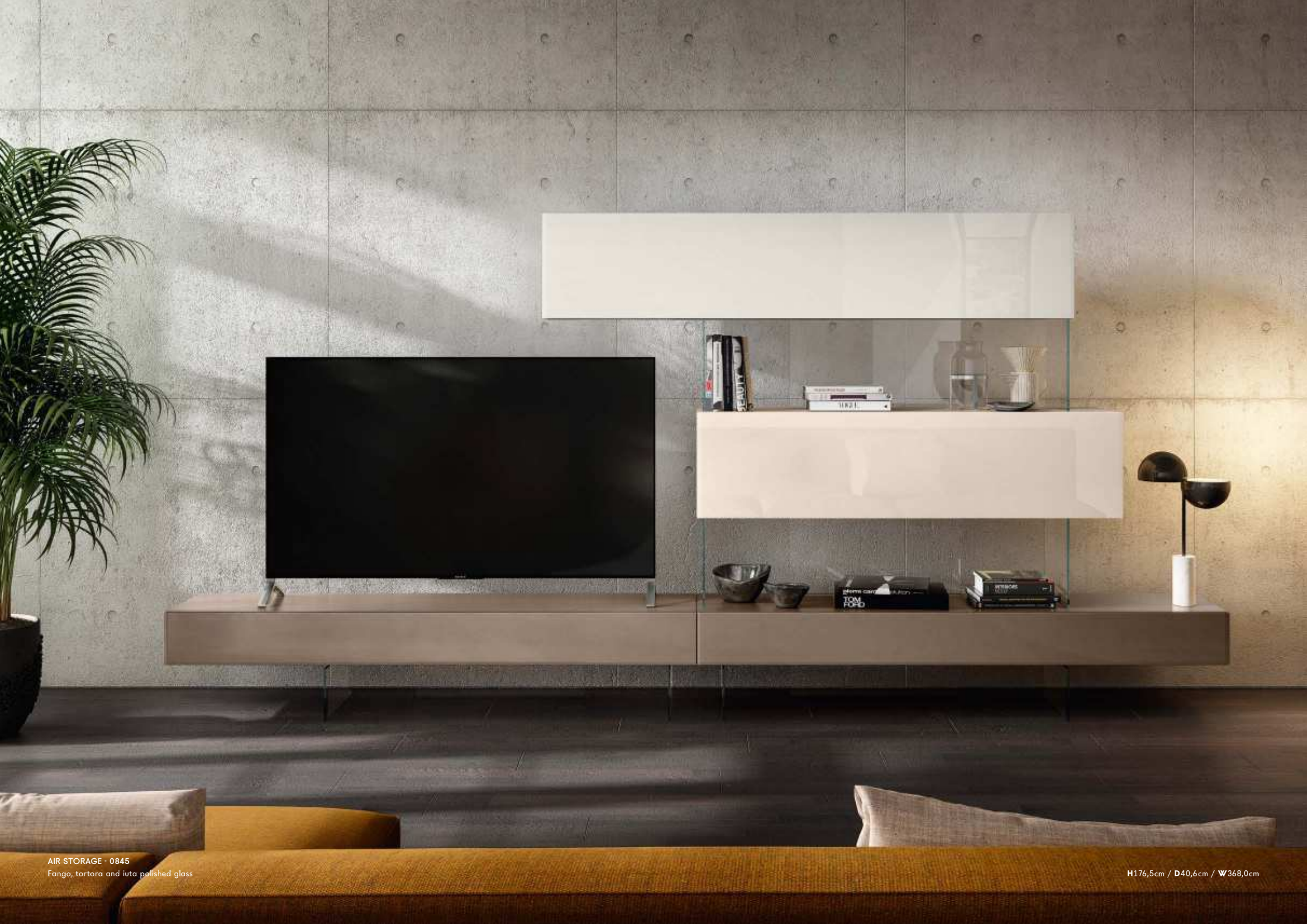
AIR STORAGE - 0845 Fango, tortora and iuta polished glass