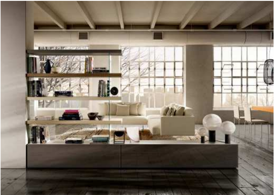
Fumo polished glass, lacquered fumo, fango, bianco and spago