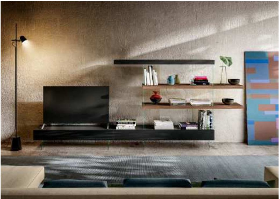
Nero polished glass, lacquered nero and Haywood