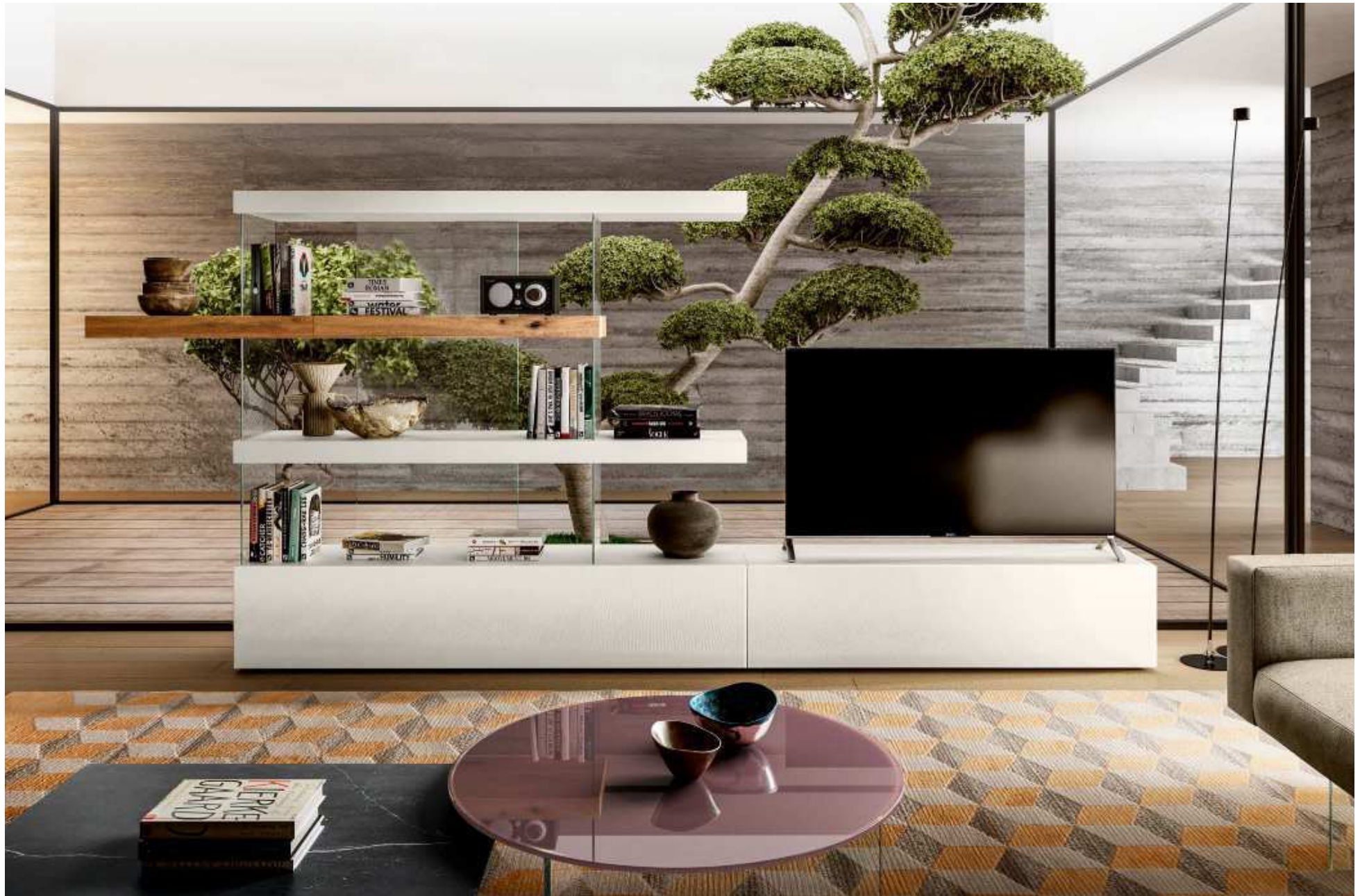
AIR STORAGE - 0695 Bianco polished glass, lacquered bianco and Wildwood naturale