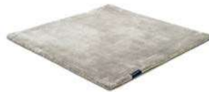
bright chrome 3700